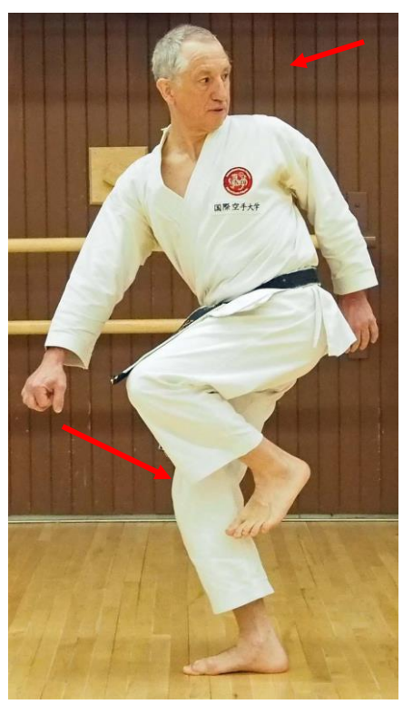
Photo 13 Photo 14 Photo 15 Working on balance and look at the target