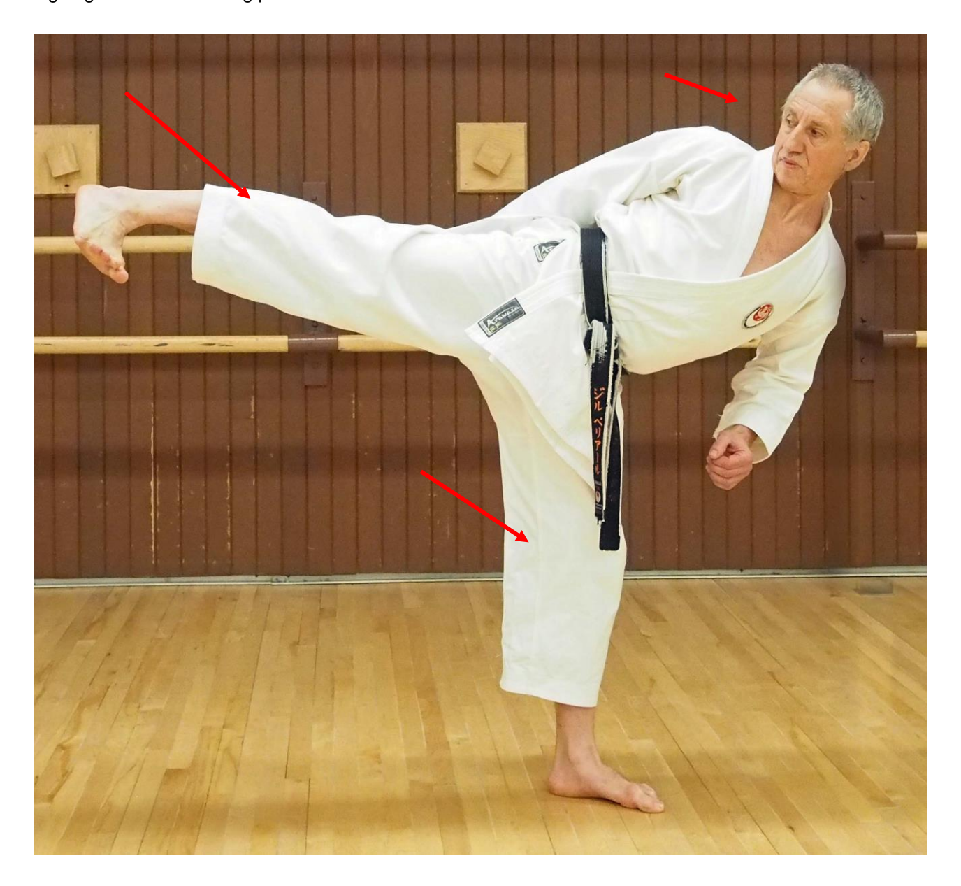
Photo 16 Bending the knee, look at the target and extending the leg

The third and last drill combined the first and the second drill with the extension of the leg (photo 16). There is two main points with this drill: 1) working on the precision to reach the target and 2) thrusting the leg to generate the striking power.